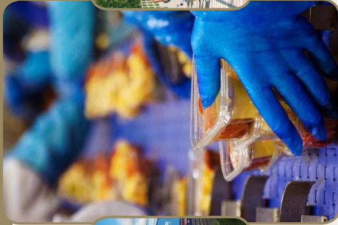
OUTSTANDING WORKFORCE INITIATIVES