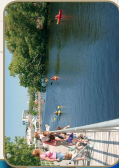
GREAT QUALITY OF LIFE